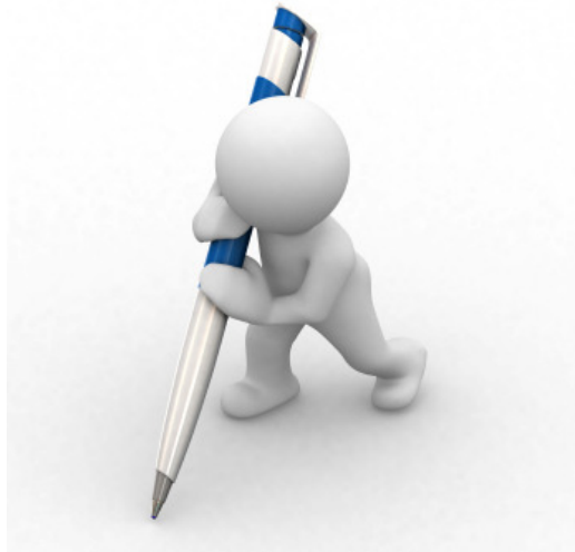
Writing on the Blog