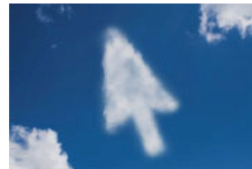
Sinergy with OW2 OSCi