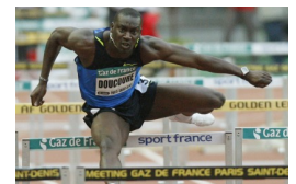
Ladji Doucouré Orange Sports